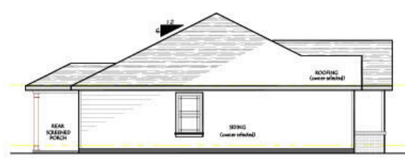
RIGHT SIDE ELEVATION SCALE: 1/4" = 1'-0"