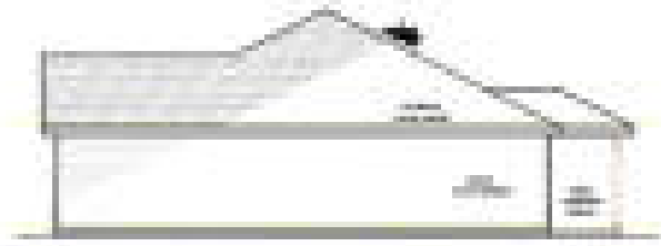
LEFT SIDE ELEVATION BASE 10'0" x 24'0"