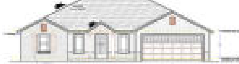
FRONT ELEVATION BASE 10'0" x 24'0"