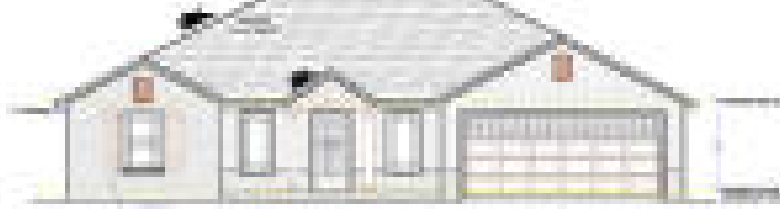
FRONT ELEVATION 2024-10-10