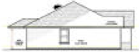
RIGHT SIDE ELEVATION 2024-10-10