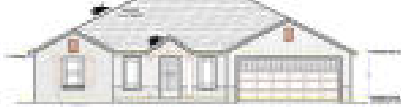
FRONT ELEVATION 2024-10-10